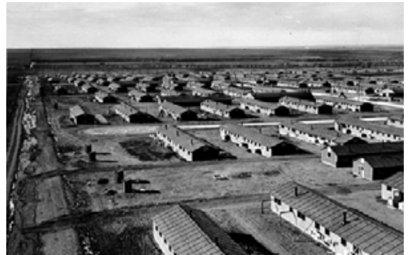
Japanese American Internment Camp.