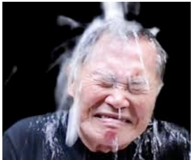
George Takei takes the Ice Bucket Challenge to raise money for ALS (amyotrophic lateral sclerosis). 2014

Today, George Takei has become a famed actor and leader in many areas for his social justice work. The seeds planted long ago – the experience of internment, the support and influence of parents, and a love of theater combined to grow a myriad of projects and passion, which keep him at the forefront of several contemporary causes. George doesn't believe the different social causes he fights for are separate issues. Rather, he believes “They're all the same; it's a matter of equality, and matter of justice, a matter of what's there.” Not only is he one of the country's most successful Asian American actors, but he uses this success and recognition with great skill in gathering attention and support. Whether he is speaking out for LGBT rights, talking about diversity in acting, or singing on stage, there is no question. George Takei is a leading man.